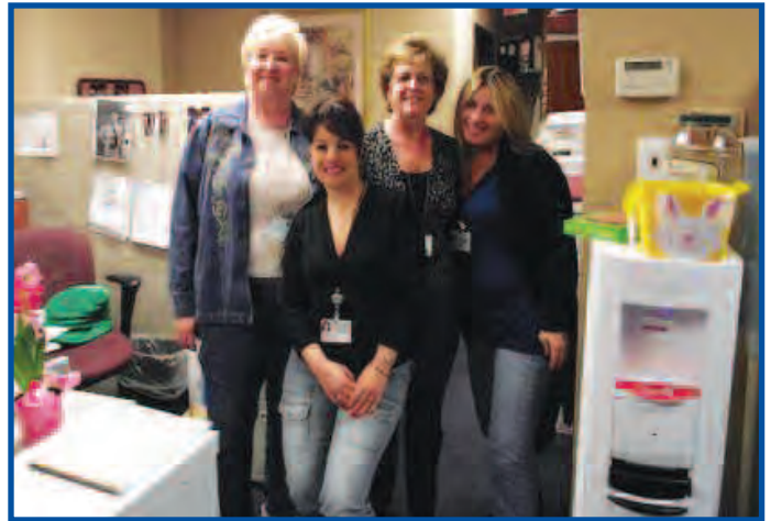
Cadbury at Cherry Hill staffers wear their jeans and help the cause.

Remembering the success of a project at the Lewes campus, they suggested a reward for those staff members who contribute to the fund—they get to wear blue jeans to work on Fridays. So far, they have contributed $670 to the drive!